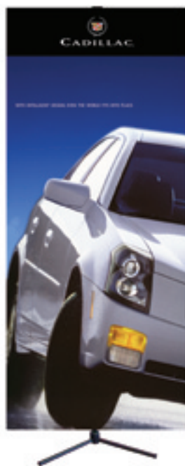
32" x 78" Lambda graphic