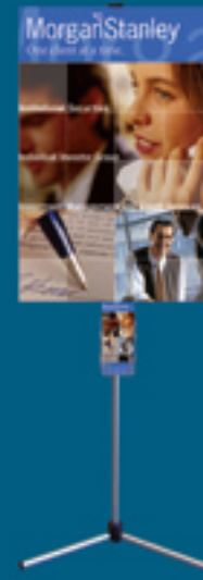
Lambda graphic with small literature holder