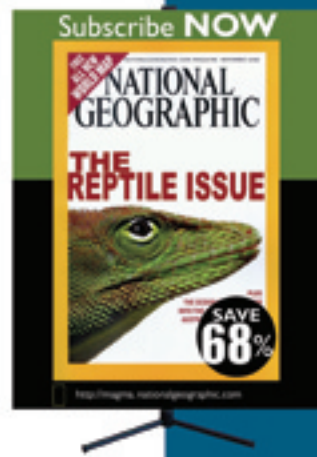
48" x 60" table top fabric banner stand